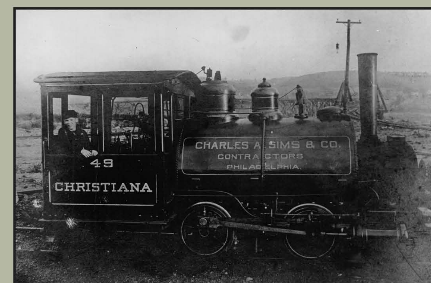
Moore's Memorial Library, Christiana, PA.