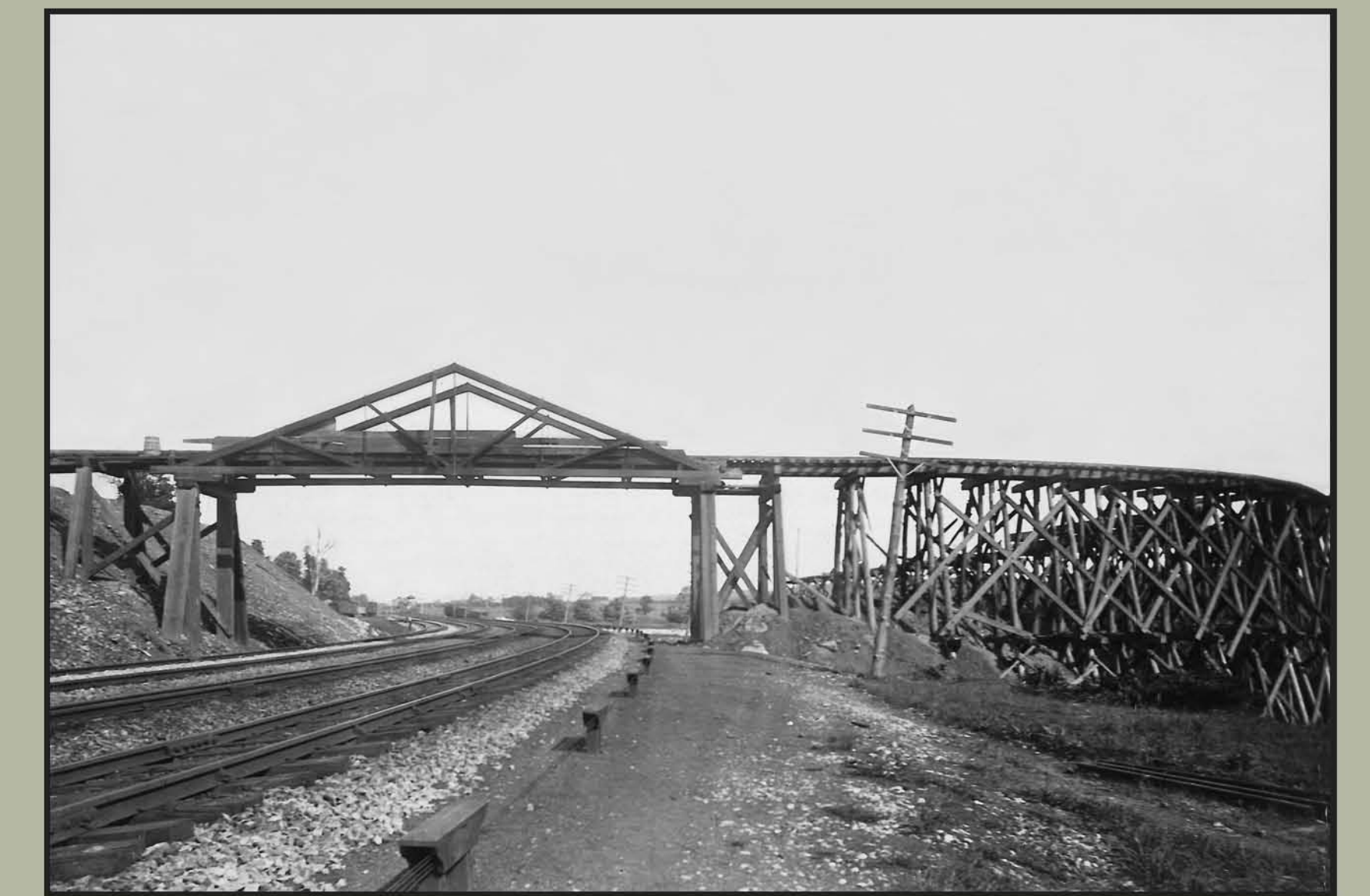
Moore's Memorial Library, Christiana, PA.