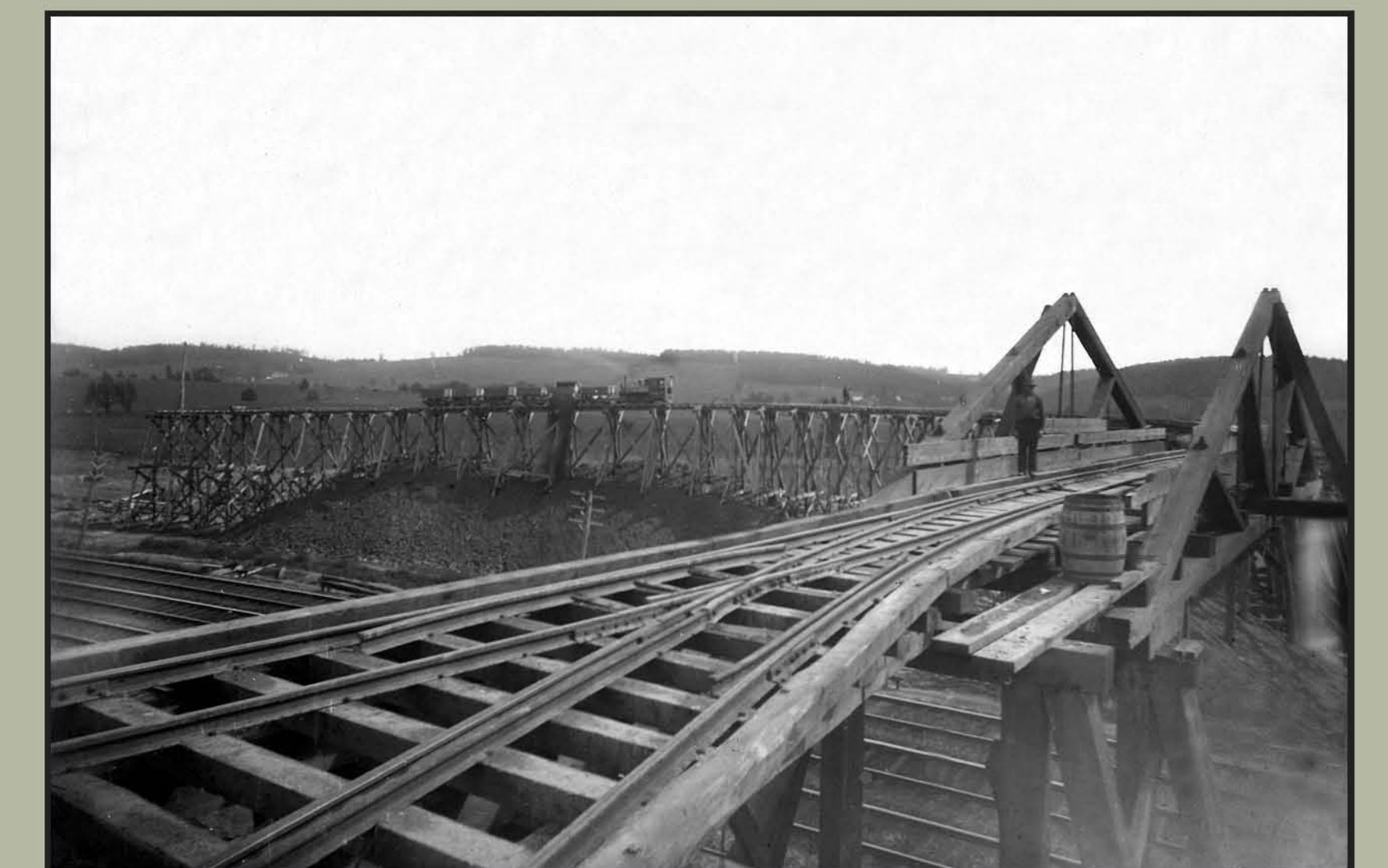
Moore's Memorial Library, Christiana, PA.