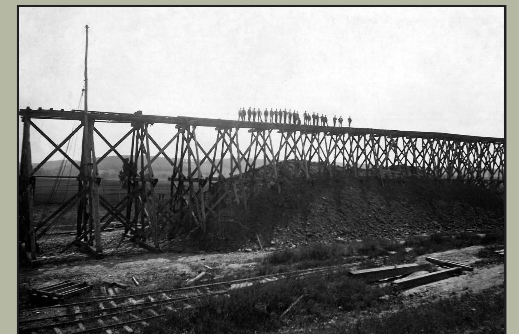
Moore's Memorial Library, Christiana, PA.