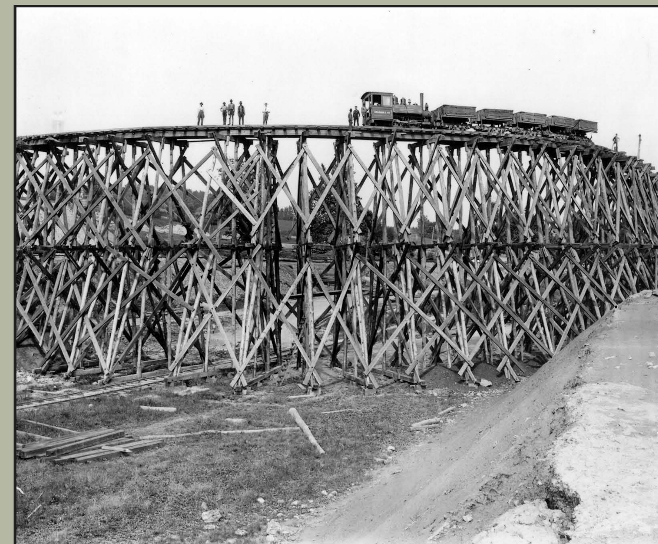
Columbia Historic Preservation Society, Columbia, PA.

For more than one hundred years, the Noble Road Bridge has framed an eloquent view of the boundary between Chester and Lancaster Counties. For all the earth moved, the road and stream, so critical to settlement in earlier centuries, continue their courses undaunted by the PRR's great freight road.