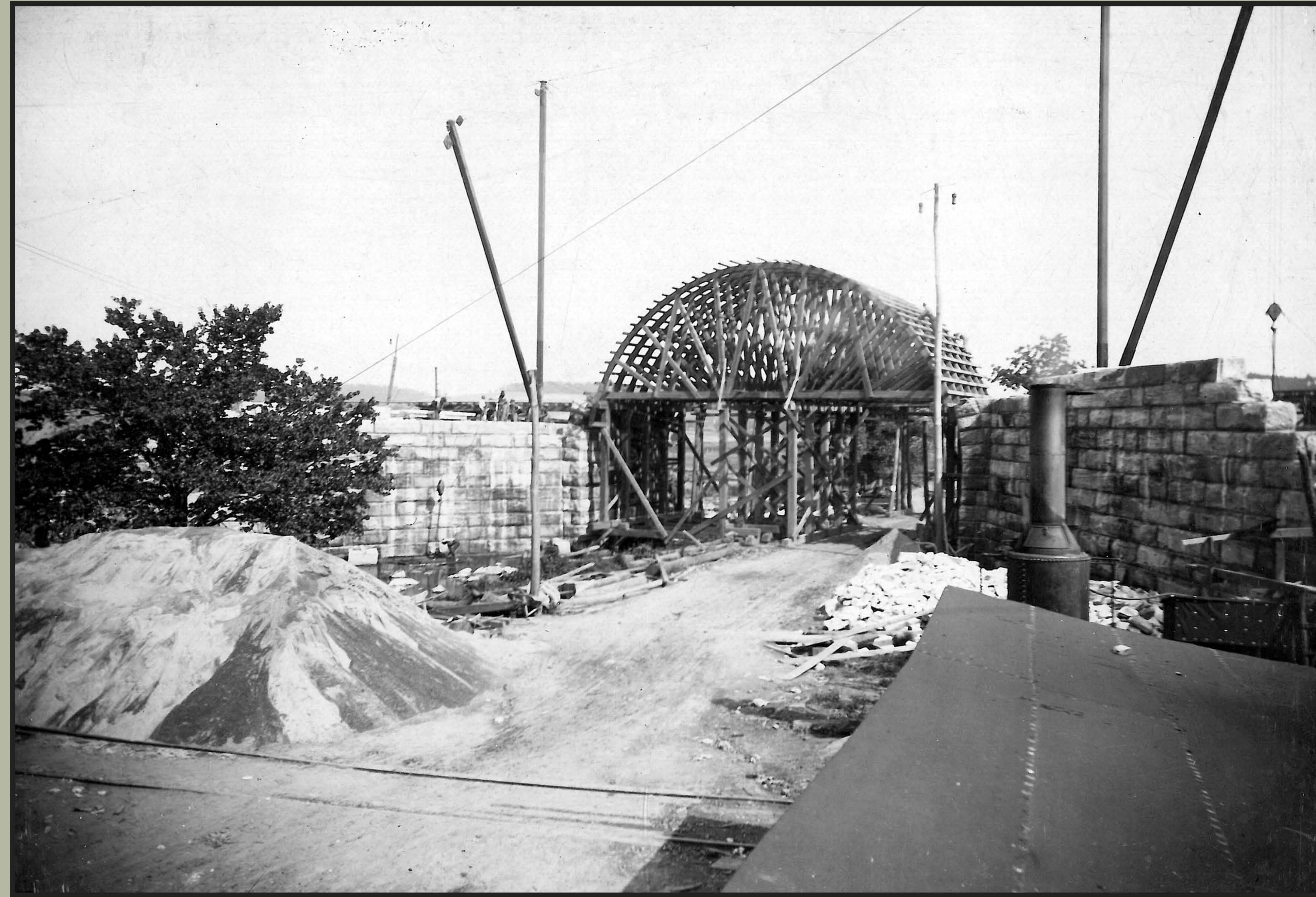
Moore's Memorial Library, Christiana, PA.