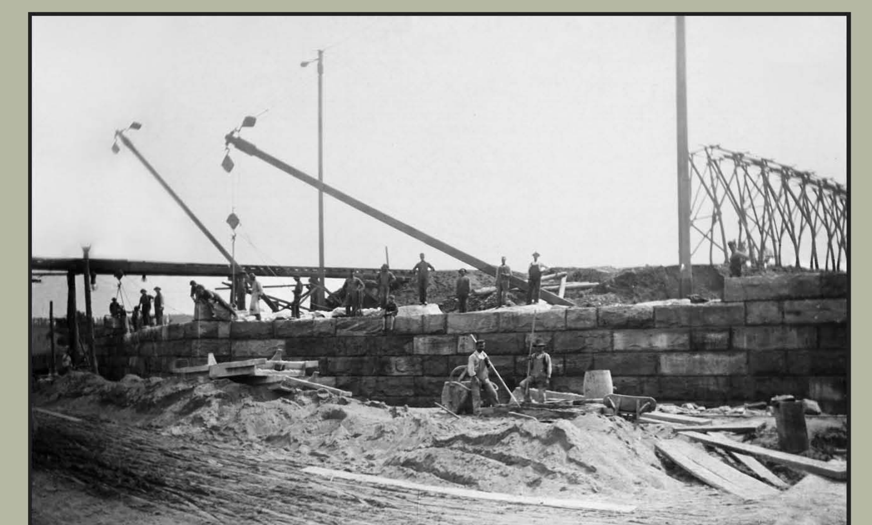
Moore's Memorial Library, Christiana, PA.